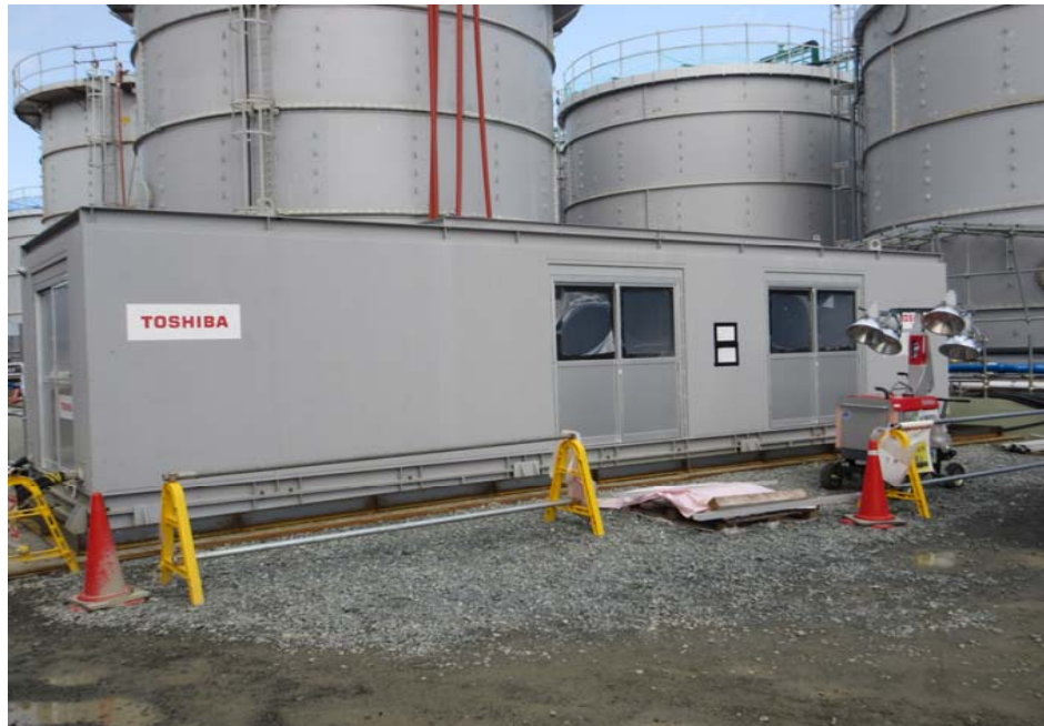
External appearance of second mobile-type strontium removal equipment (G6_C/D tank area)