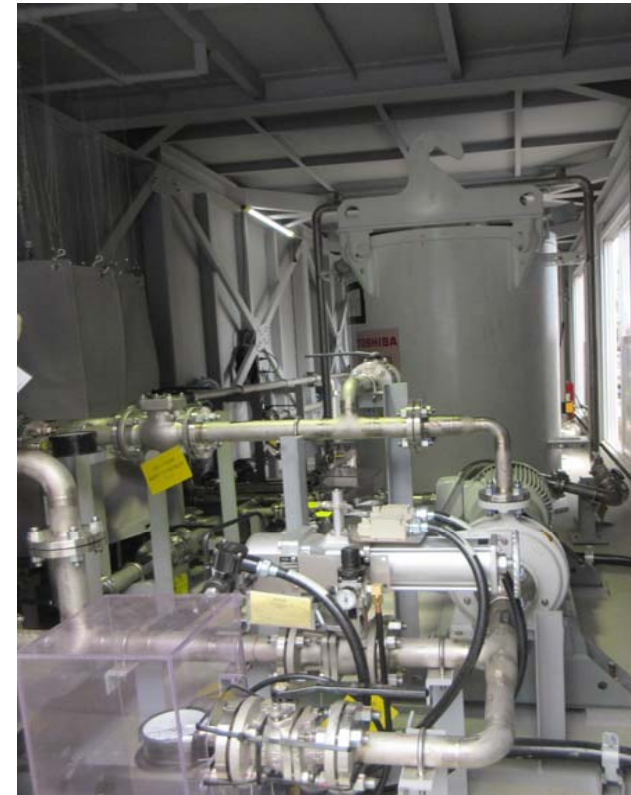
Adsorption tower of second mobile-type strontium removal equipment (G6_C/D tank area)