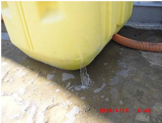
Situation as of discovery