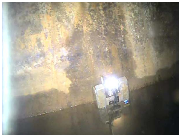
During the water level measuring

[Note] It is estimated that the water level inside the S/C is influenced by the change of the water level of accumulating water inside the torus room.