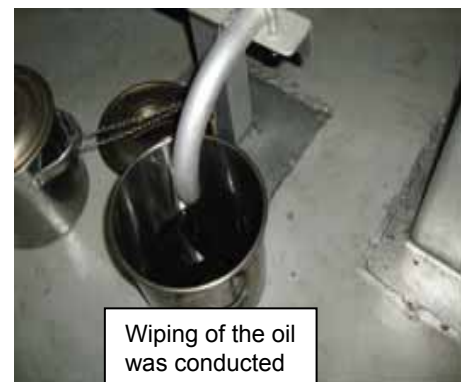
Wiping of the oil was conducted