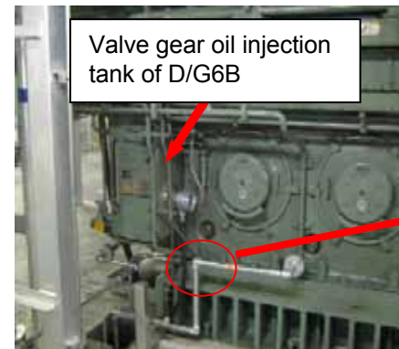
Valve gear oil injection tank of D/G6B