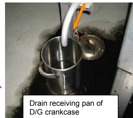
Drain receiving pan of D/G crankcase