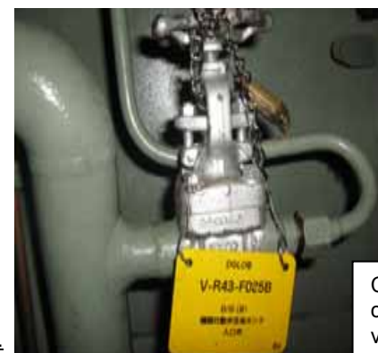
Chain lock used to ensure the closing of the supply valve of the valve gear oil injection tank