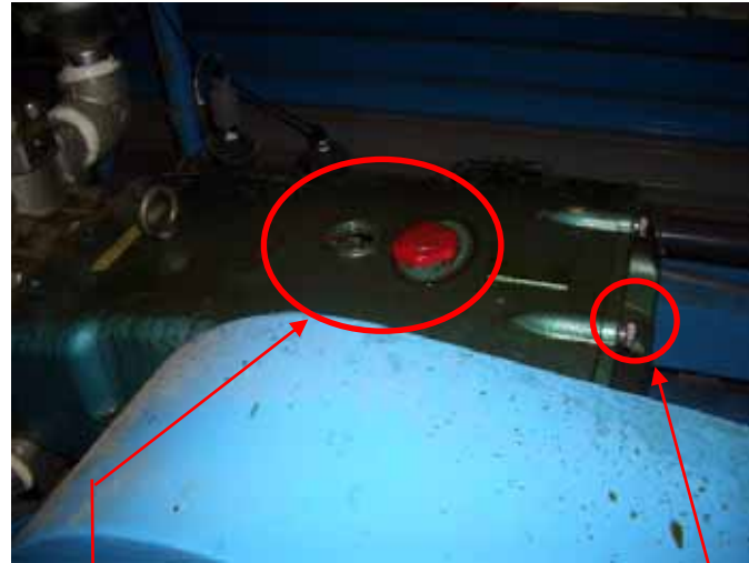
Oil filler opening of a high-pressure pump