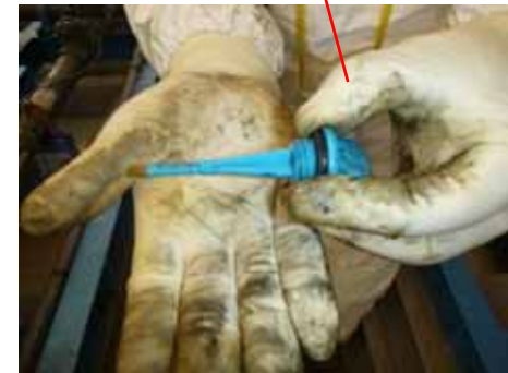
Oil gauge (same item with the gauge used when the incident occurred)