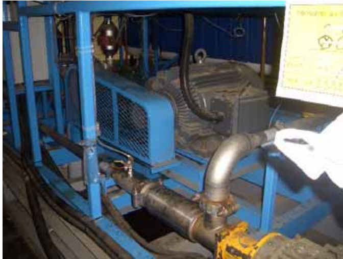
Appearance of a high-pressure pump