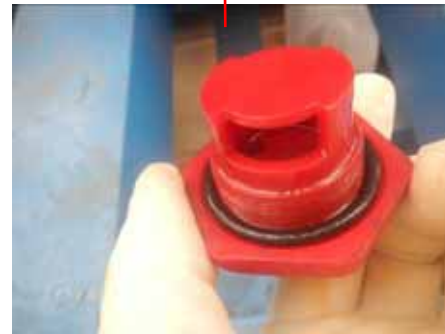
Oil filler cap (same item with the cap used when the incident occurred)