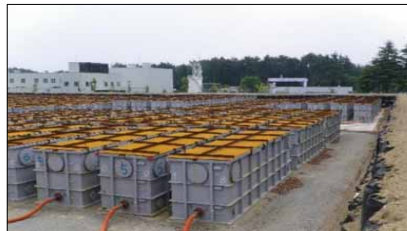
Example: Installation of notch tanks