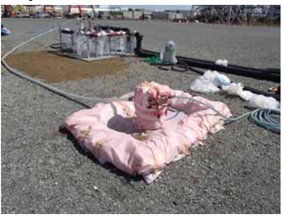
Installation of the pump at underground reservoir No. 3 (photo taken on April 13)

: Detection holes with high radioactive material densities