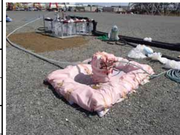
Installation of the pump at underground reservoir No. 3 (photo taken on April 13)

[Yellow box] : Detection holes with high radioactive material densities