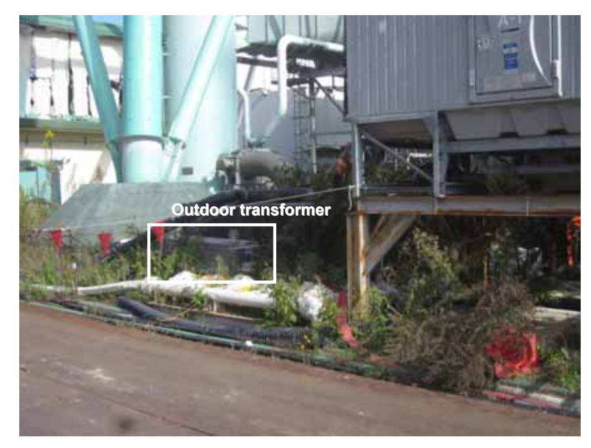
Photo 1: Outdoor transformer for Unit 2 spent fuel pool alternative cooling system at Fukushima Daiichi Nuclear Power Station