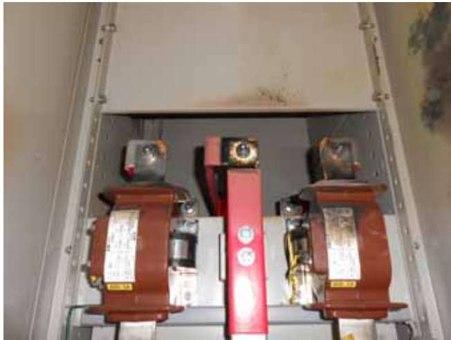
Soot found on the instrument current transformer (terminal) of Units 3-4 temporary M/C