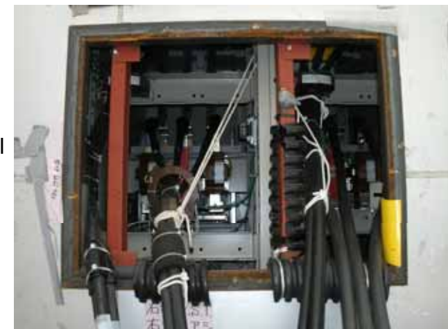
Units 3-4 temporary M/C with the power panel door opened (below the power panel where soot was found)