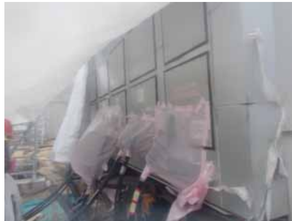
Appearance of Units 3-4 temporary M/C