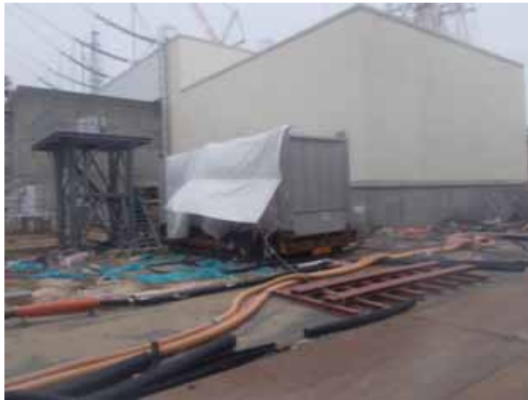
Full view of Units 3-4 temporary M/C M/C (A) (Photo taken at Units 3-4 switchyard)

< Reference > March 20, 2013 Tokyo Electric Power Company