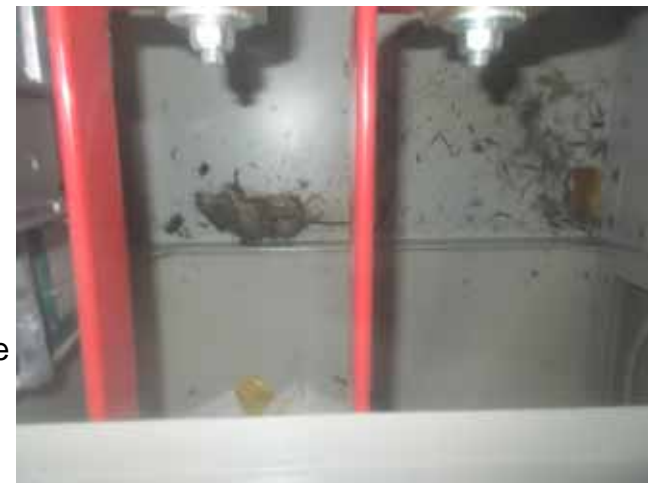
Small animal found dead (Photo taken from above)