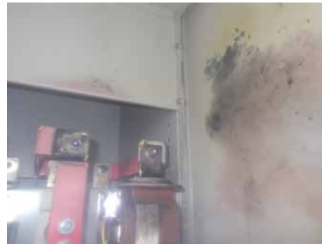
Soot found on the walls of Units 3-4 temporary M/C