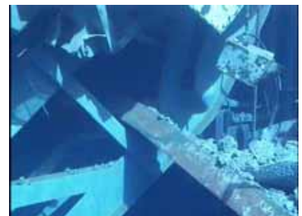
Photo 5: Bridge of the fuel handling machine