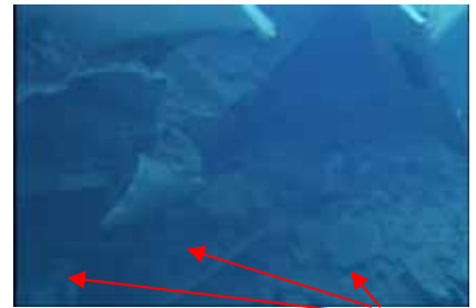
Photo 1: The lower part of the fuel handling machine and the fuel rack