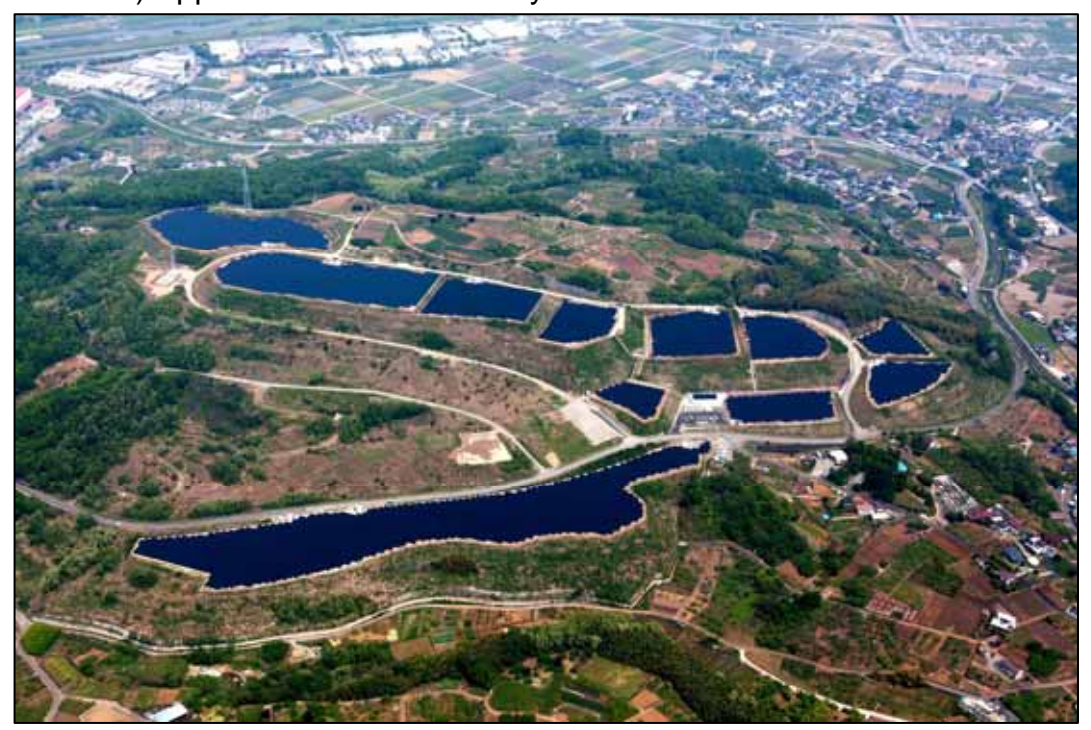
(Reference) Appearance of Komekurayama Solar Power Station