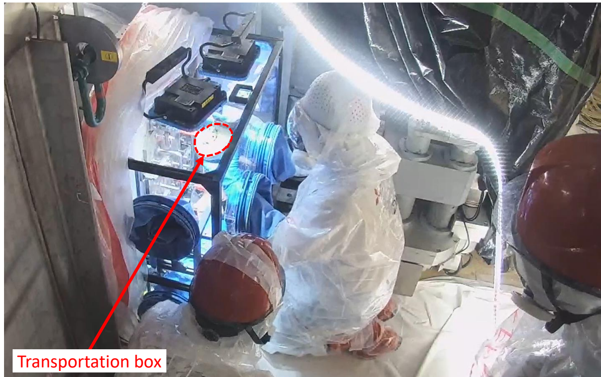
Removing the transportation box from the side hatch of the enclosure