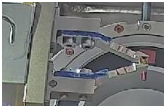
End jig grasping the fuel debris (photographed from above the enclosure)