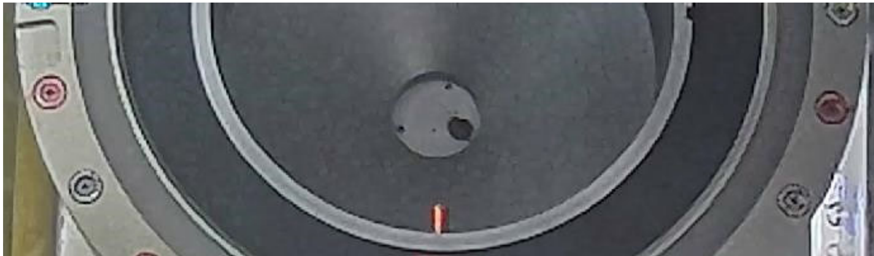
The sampled fuel debris at the bottom of the transportation box