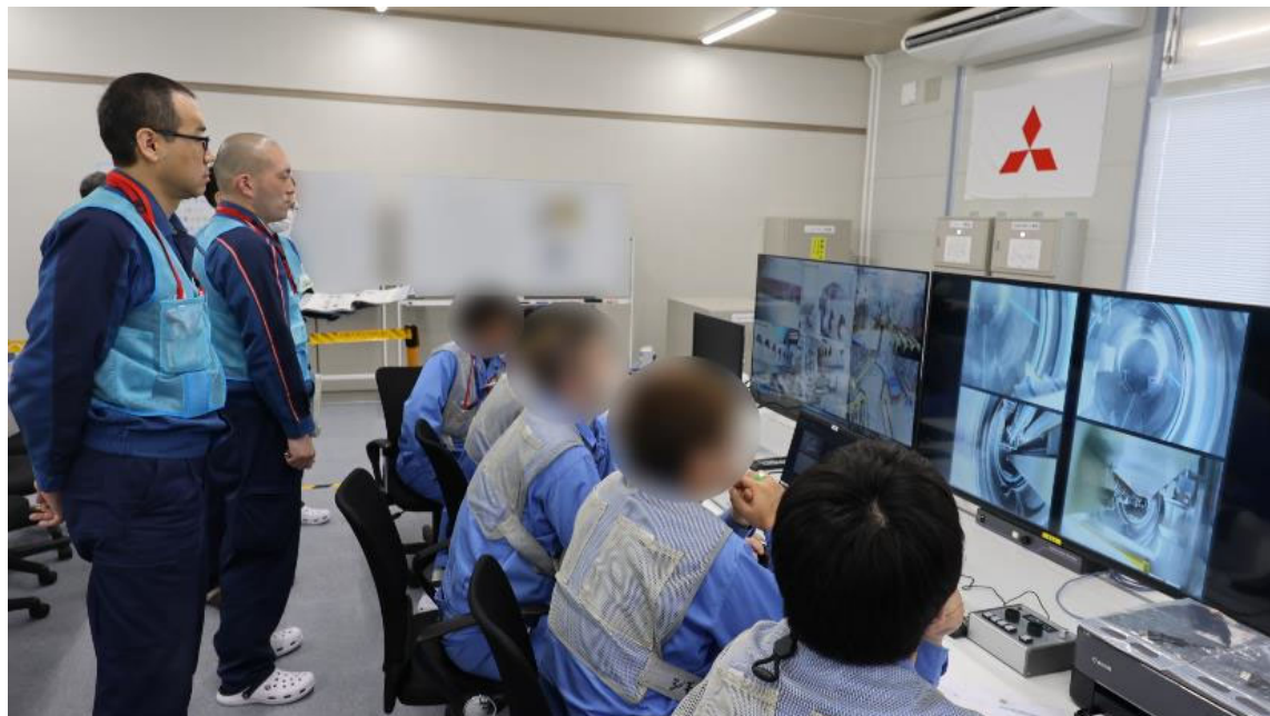
Remote operations room