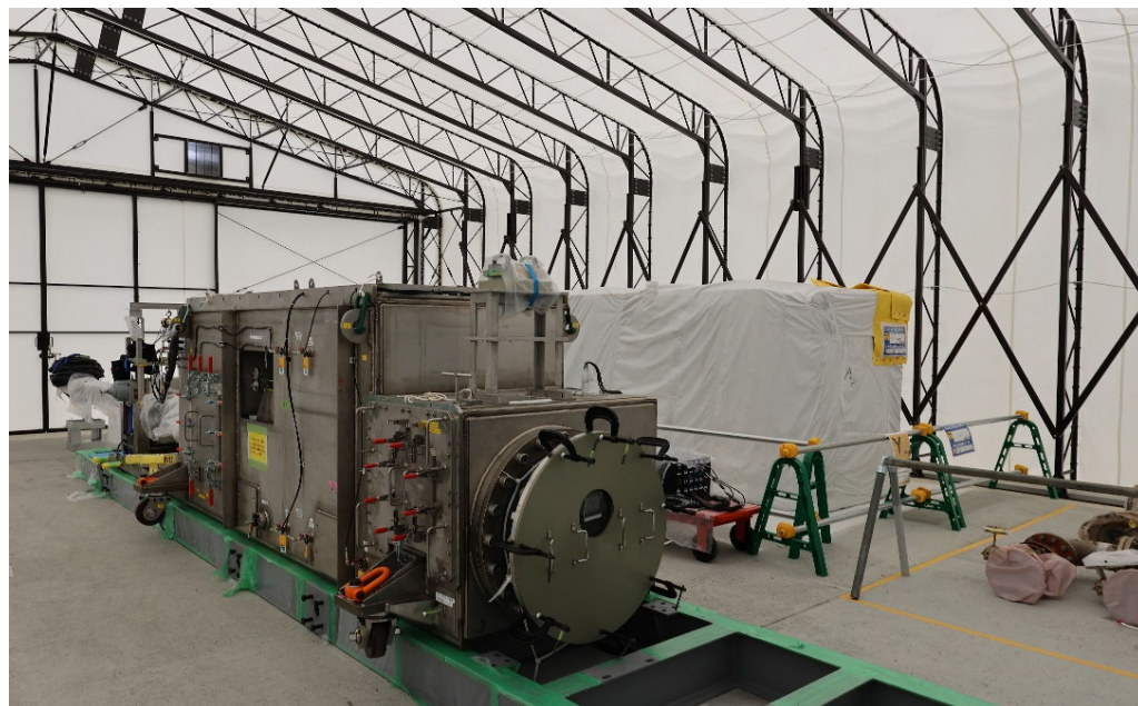
The entire view of the telescopic device (Connection pipe side)