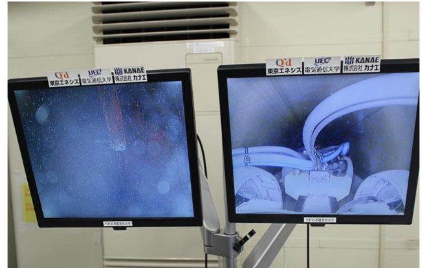
Photo 2: Installment of the snake-like robot (left: front side right: back side)