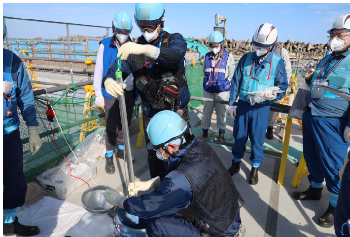
Sampling from the upper-stream storage