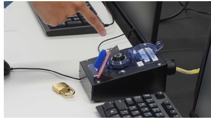
Key switch operations during the First Stage