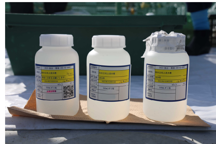
Sampling bottles (after sampling)