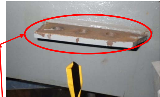
Bolts at the joint ruptured