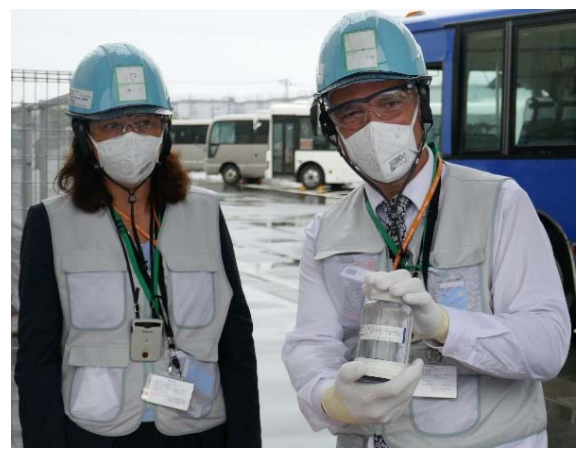
ALPS treated water