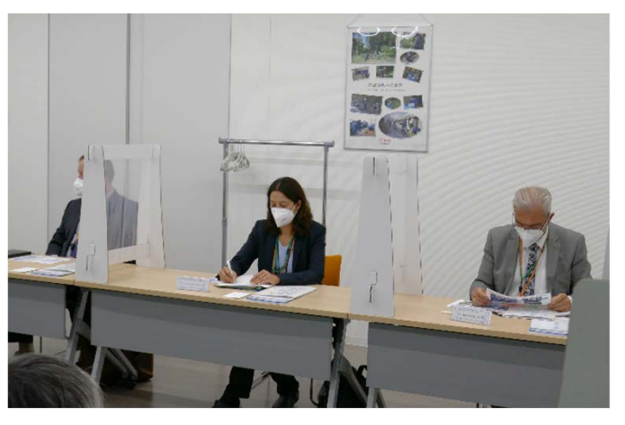
Photos taken by Tokyo Electric Power Company Holdings, Inc. on September 8, 2021