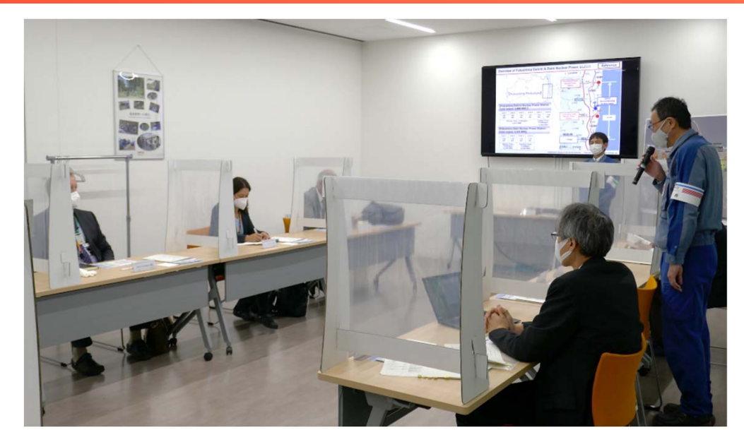
Exchange of opinions at the power station (\uparrow\downarrow)