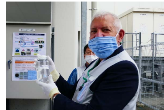
Review mission by IAEA team (August 2021)