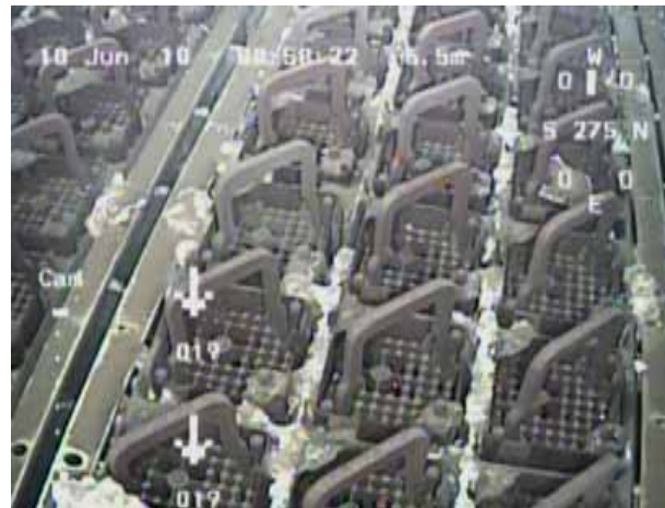
【Fuel and area above the fuel rack in the SFP】