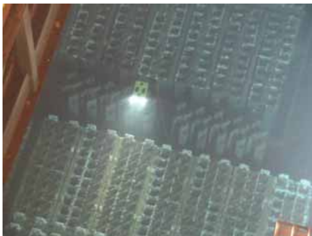
【Submersible ROV used for the investigation】