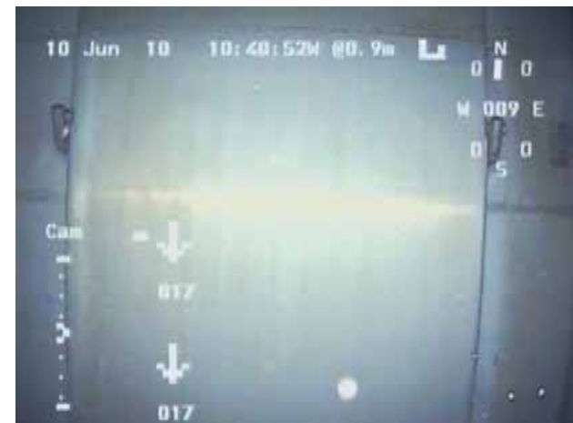
【Pool gate in the SFP】