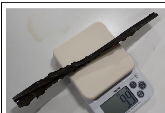
Measuring the weight of commercially available dried kelp

When it comes to feeding kelp on a regular basis, there are many things to worry about, such as ascertaining the amount of kelp eaten by the abalone, the amount to be fed to them, feeding methods, and how to prevent dried kelp from dissolving in the water and degrading the rearing environment. It all begins with trial and error at the training and rearing facility.