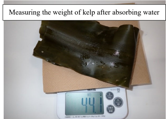
Measuring the weight of kelp after absorbing water