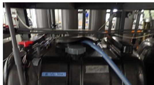
Filtered seawater is stored in dedicated tanks