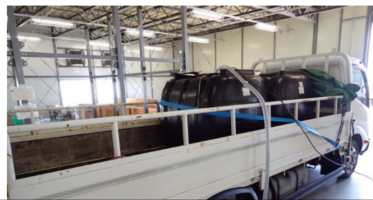
Collecting seawater from near the power station and bringing it in by truck