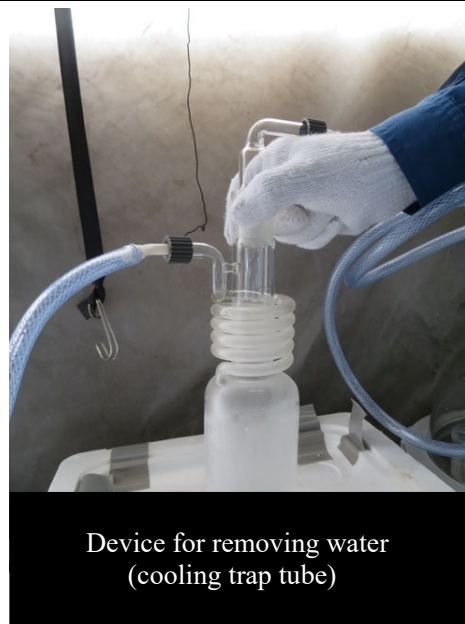
Device for removing water (cooling trap tube)