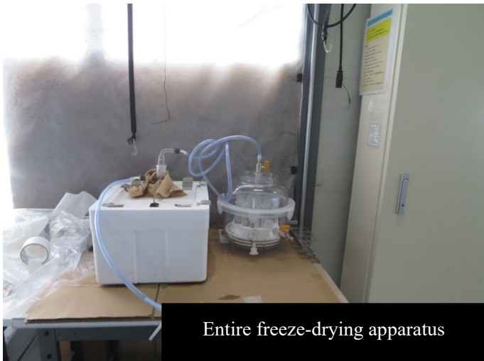
Entire freeze-drying apparatus

During the breeding tests, we are also analyzing tritium that is bound to muscle tissue (organic) molecules (organically bound tritium). As is the case when analyzing tritium in bodily fluids, during specimen preparation the specimens are freeze-dried and the water must be removed from the large volume of samples. That is why we use instruments that are capable of processing large quantities at one time.