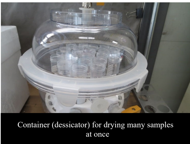
Container (dessicator) for drying many samples at once