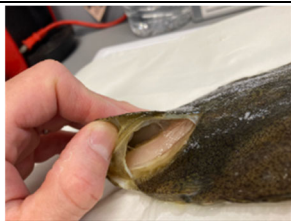
A flounder which was suffering from anemia caused by parasites ( Neoheterobothrium hirame ) at rearing training.

Flounder's anemia caused by parasites ( Neoheterobothrium hirame ) which we struggled about 6 months ago at rearing training phase. At rearing test, we perform microscope observation once a week but no eggs of parasites are found from either the tanks of regular seawater nor ALPS treated water added. We will stay focused on and continue to rear and observe them.