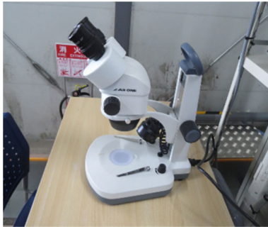
A microscope for checking eggs