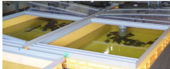
Healthy flounders (in ALPS treated water added tank)