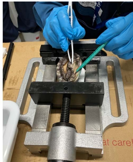
② Dissect adductor without damaging organ