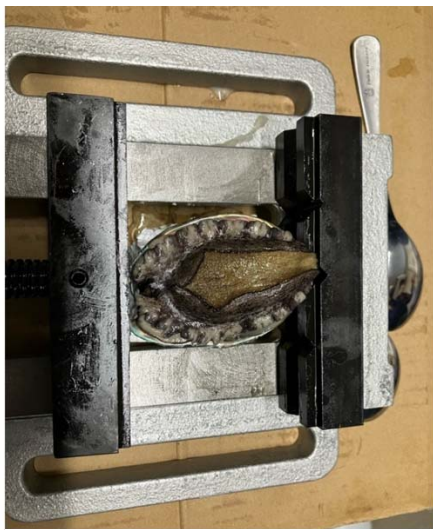
□ Clamp an abalone firmly

We will start rearing test of abalones next week. Prior to rearing test, we practiced preprocessing of analysis (removal of inedible parts such as shell). All the body parts other than mouth, digestive system, and shell will be analyzed. Now, residual organs divided opinions among caretakers such as “are guts of abalones edible or not”.