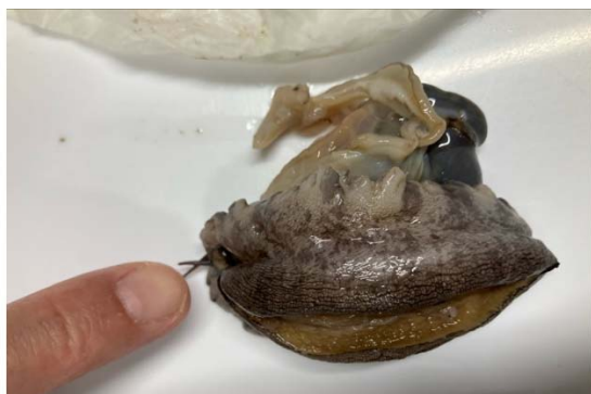
③ Removal of shell then carving edible part.