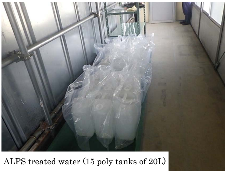
ALPS treated water (15 poly tanks of 20L)

ALPS treated water for rearing training (15 poly tanks of 20L) were brought into the rearing test facility, yesterday. Tritium concentration of ALPS treated water is 150,000 ~ 210,000 Bq/L and will be diluted with hundredfold of rearing seawater. We are rearing marine organisms in the seawater of 1,500 Bq/L.