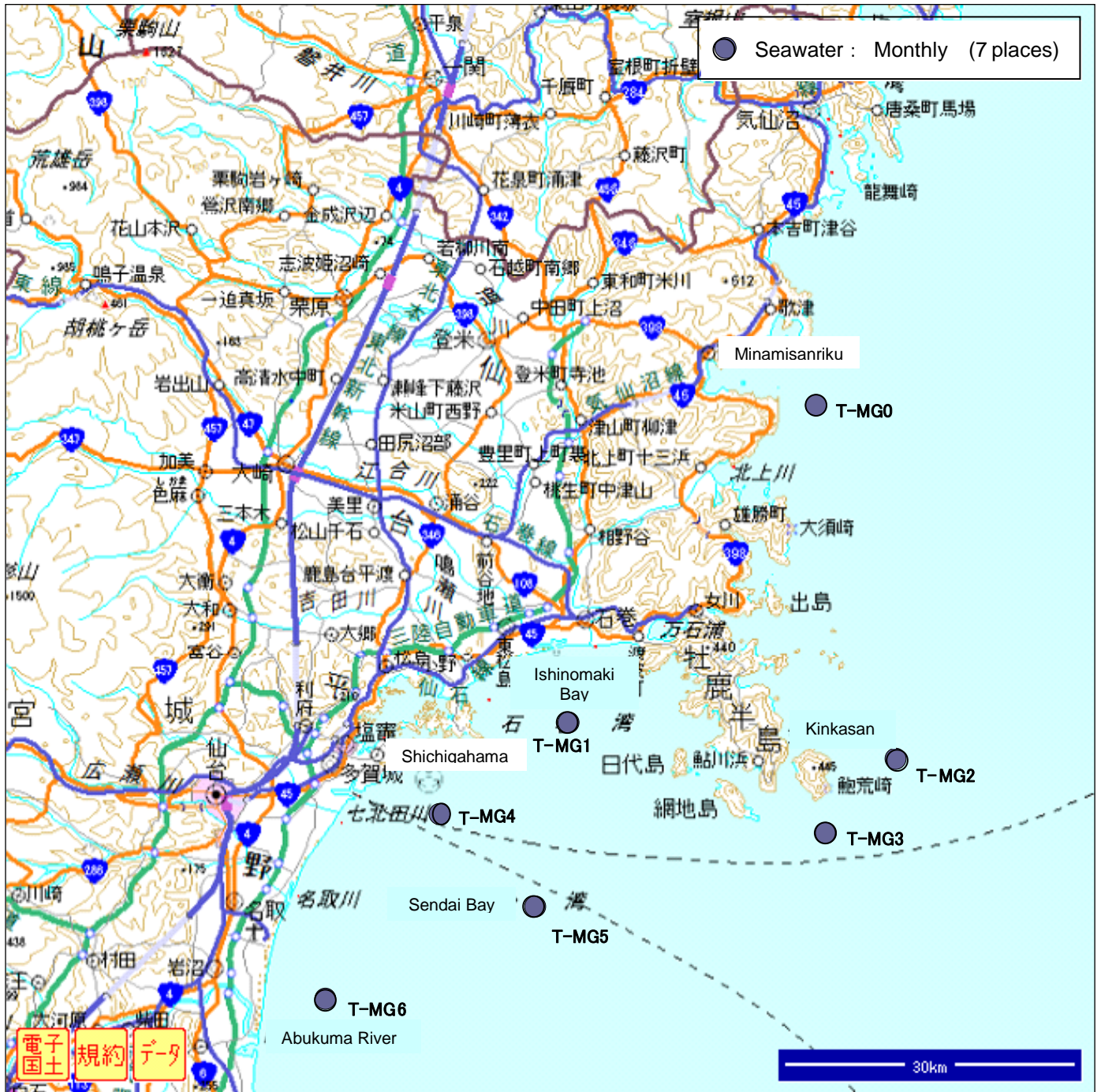
Fig.2 Sampling places of seawater (Offshore of Miyagi Prefecture)