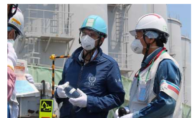
Observation of the ALPS by the IAEA Director General Rafael Grossi (May 2022)