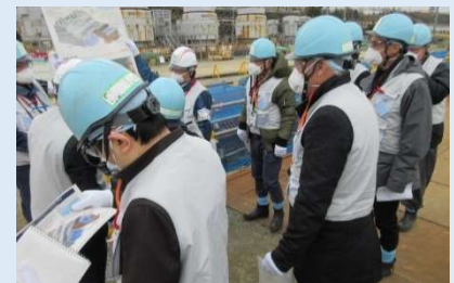
Inspection around the discharge vertical shaft