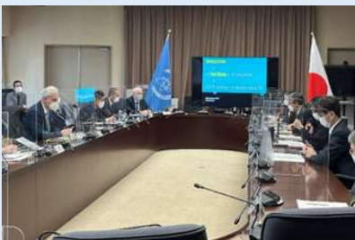
The review meeting