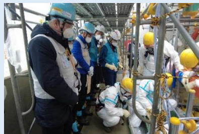
Observation of the sampling of ALPS treated water