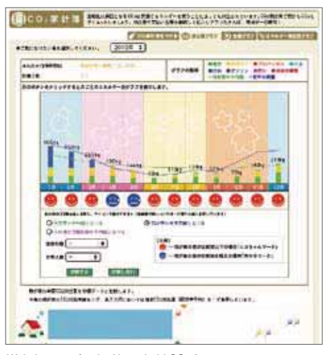
Website page for the Household CO<sub>2</sub> Accounts (Japanese site only)

The "CO2 Household Account" service on TEPCO's TEPORE life information research website allows TEPCO customers to keep track of the amount of CO2 they emit from their household, for effective management of CO2 emissions on a continuous basis. It supports eco-lifestyles that are both friendly to the Earth and to household finances.