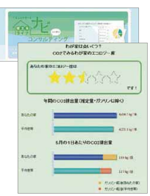
Website page for the Eco-life Navigation (Japanese site only)

TEPCO's Energy Saving Life Navigation energy diagnosis system judges the "ecological level" of a household in five stages based on a comparison with similar households, as well as allows customers to simulate energy-saving effects and offers advice according to each customer's energy usage pattern.